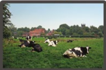
Warmingham village from the west.