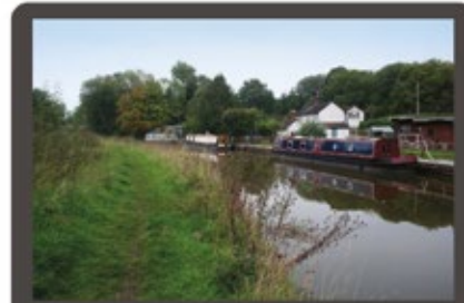
The Trent & Mersey Canal runs for 93 miles from Preston Brook near Runcorn to Shardlow near Derby. It opened in 1777.