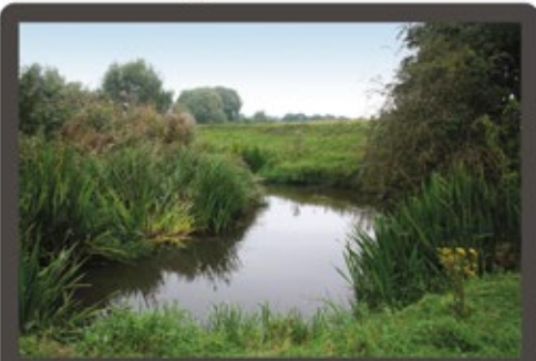
The River Wheelock flows northwards and into the River Dane at Middlewich.